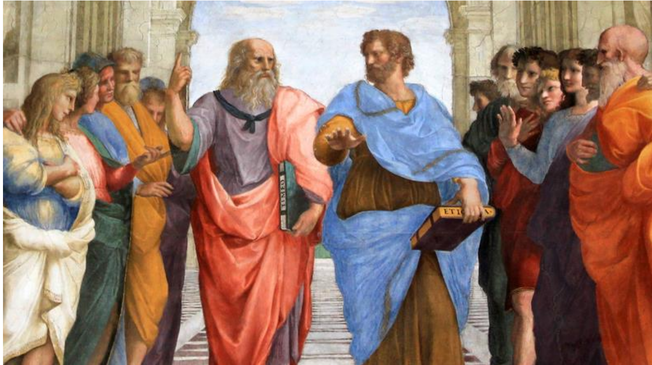
Depiction of Plato and Aristotle walking and disputing in Ancient Greece, by Raphael (painted, circa 1510 A.D.)